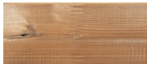
Thermory glued thermo-pine post, 130 x 130 mm