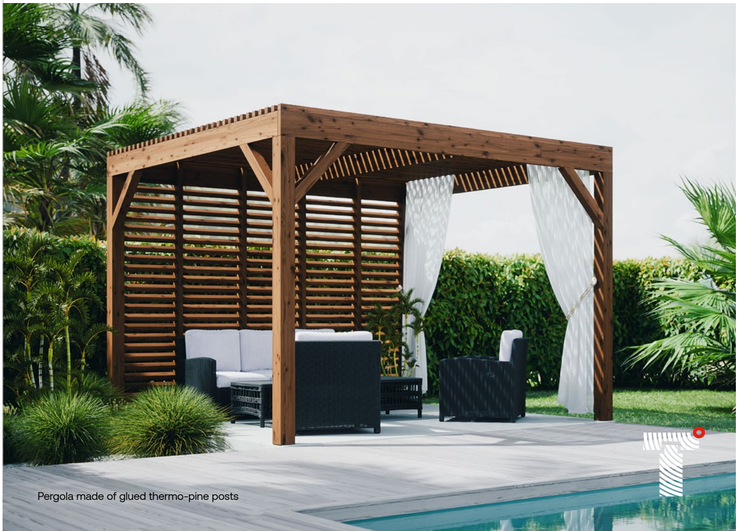
Pergola made of glued thermo-pine posts