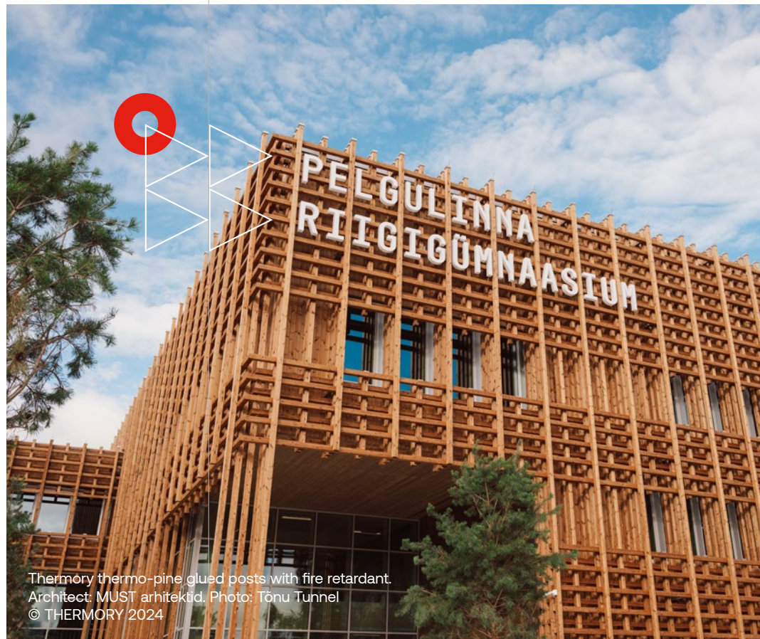
Thermory thermo-pine glued posts with fire retardant. Architect: MUST arhitektid.