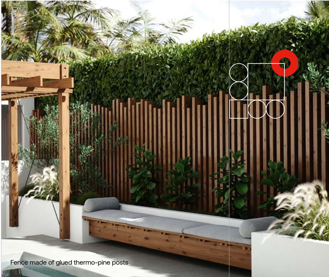
Fence made of glued thermo-pine posts